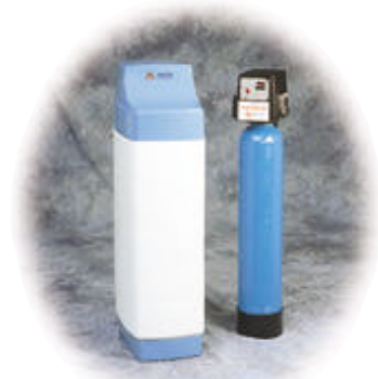
MBAC Self Contained Cabinet