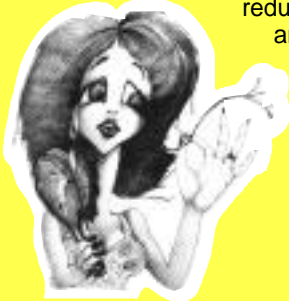
Soft water is better for your splitting hairs.

Conditioned water enhances the effectiveness of cleaning agents which helps save on detergents, cleaners, soaps, shampoos and conditioners. Soft water makes laundry come out cleaner and brighter. Dishes and glassware sparkle because soft water helps reduce spotting and residue. Bathing and washing in conditioned water gives hair a naturally clean and lively sheen and leaves skin feeling soft and smooth.